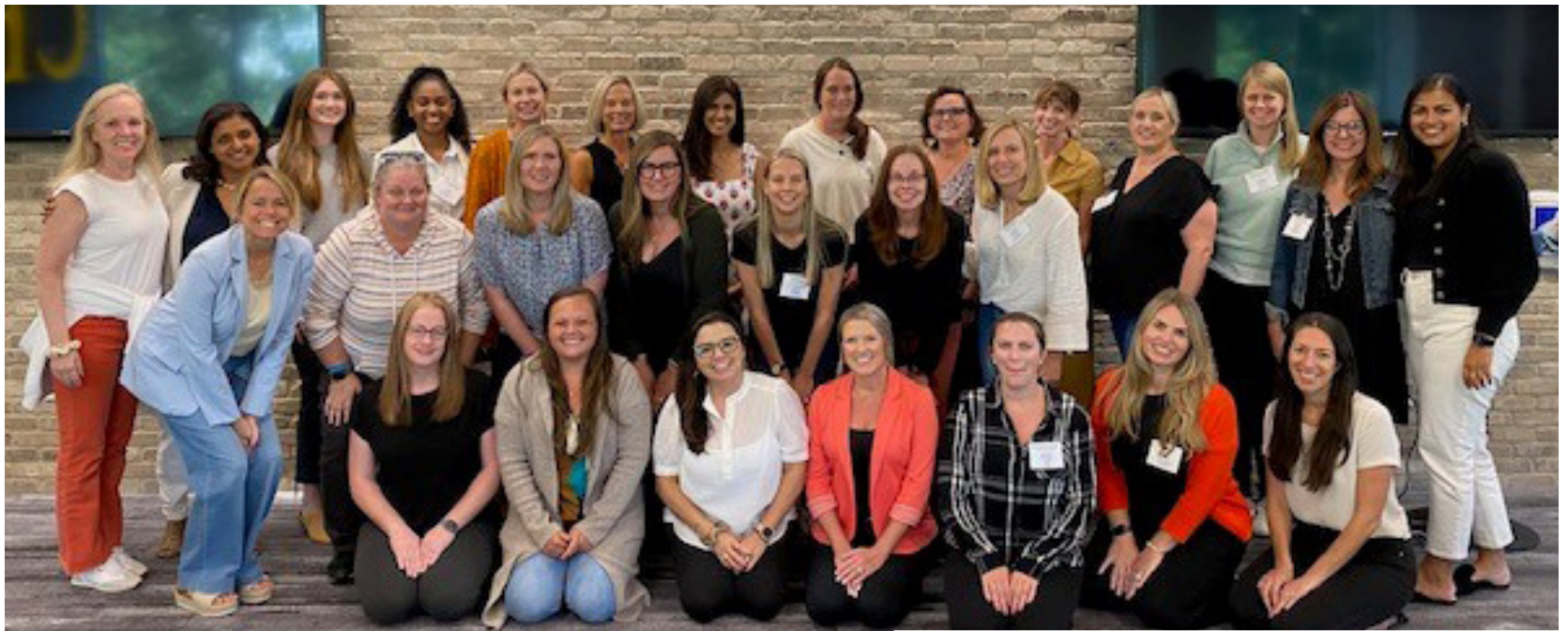
CREW Charlotte's 2023 Authentic Leadership Class