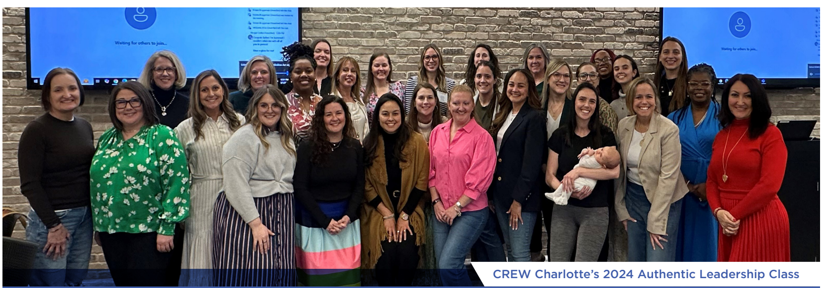
CREW Charlotte's 2024 Authentic Leadership Class