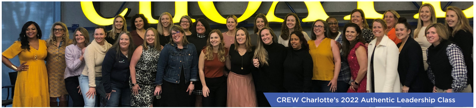
CREW Charlotte's 2022 Authentic Leadership Class