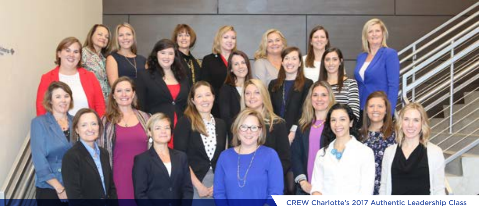
CREW Charlotte's 2017 Authentic Leadership Class