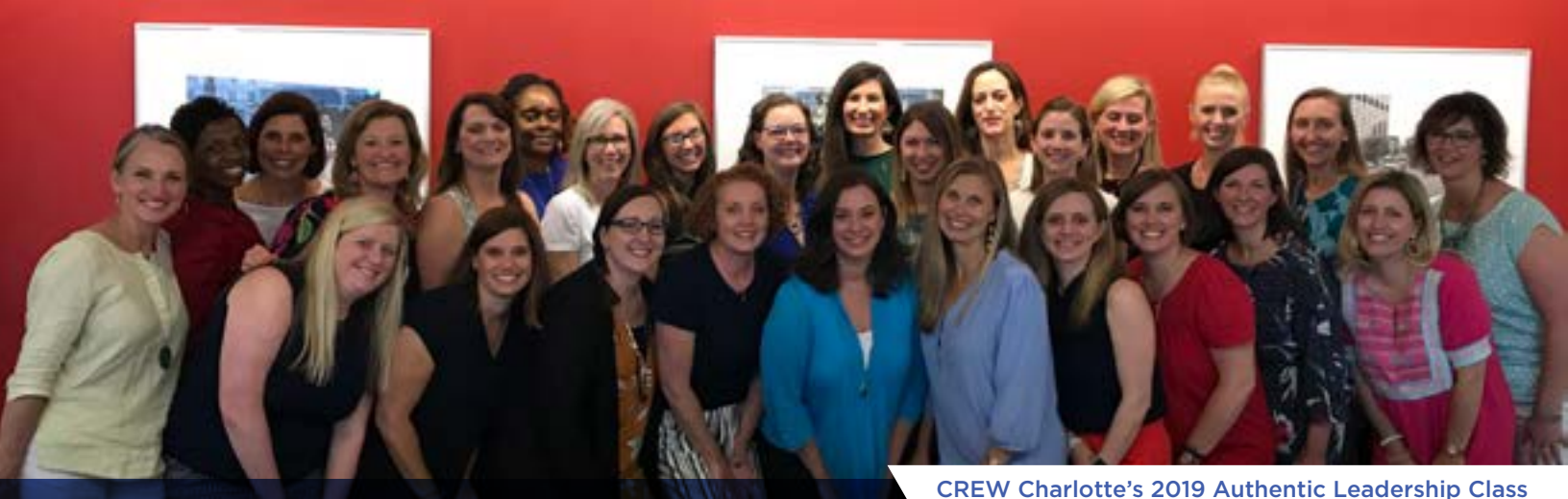
CREW Charlotte's 2019 Authentic Leadership Class