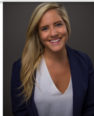
Sterling Scott McMillan, PLLC

This was my third Convention and once again it proved to be a place of inspiration, cutting edge CRE trends and endless networking