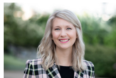
Amber Westerduin McMillan, PLLC