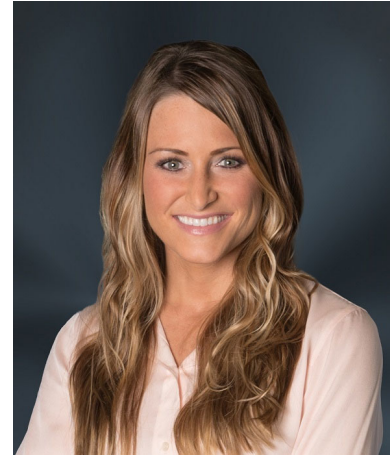
Sloan Kormelink Edifice